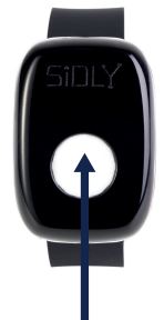
The SOS button

If you did not hear the "sending SOS message" and cannot see the red light - then PRESS AND HOLD DOWN the SOS button once again